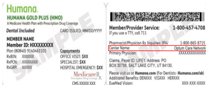
Above is an example of the Humana OCN plan Proliance is in network with.

For additional assistance, please call Humana Customer Service.