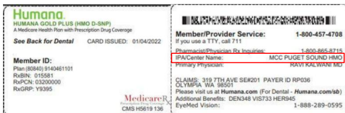
Above is an example of the Humana MCC plan Proliance is in network with.